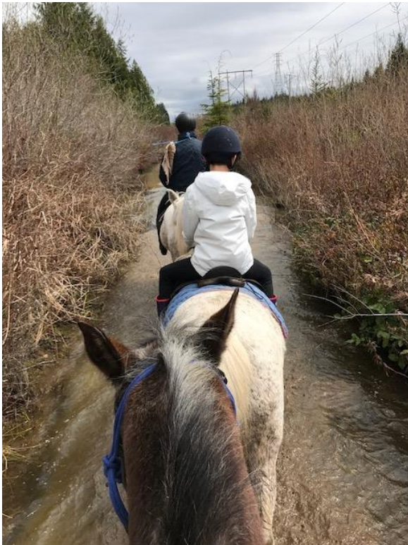
Going through the water (the ground slopes off on either side so it's best to stick in the middle!)