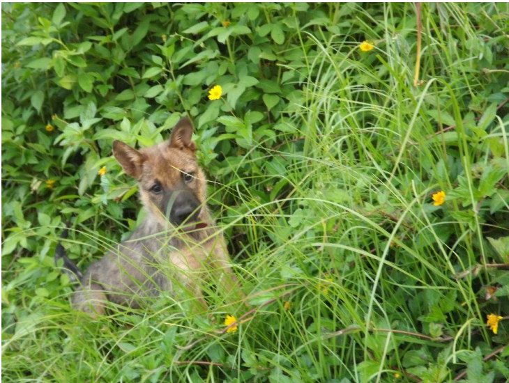
Lulu arrived at Lo Wu as a little bundle of cuteness.