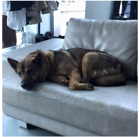
Thank you for the Lo Wu sofas!

Several livery owners ride early in the morning, and we demonstrate our excitement upon their arrival. We have two rather different personalities, and I'm (Lulu) very proud of the polite young lady (Lilly) I have raised, despite being such a rambunctious canine myself.