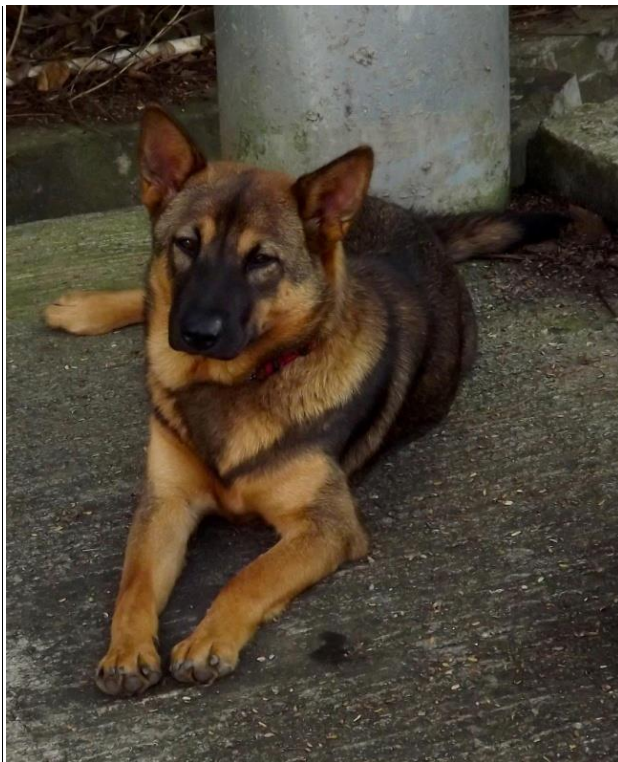
Resting in the shade.

Occasionally, our territory is threatened, as people and dogs make the incorrect assumption that the path behind Lo Wu is public. I'll set the record straight - we consider it ours. The most direct route to the path is through the arenas. I learned a valuable lesson when I was about eight weeks old. Lying in camouflage amongst the sand surface, I wondered how long it would take for anyone to notice me. Well, as it happens, they didn't; not even the horse who came straight over the top of me! In fairness, he did his utmost not to actually step on me, but one ear did take a little longer to find its prickiness than the other. Lesson learned - I conduct a rapid reconnaissance for horses before sprinting through the sand now.